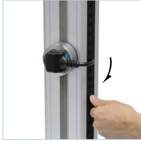
Tuck access cable into cable management compartment.