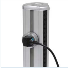
Insert plug and engage adaptor.