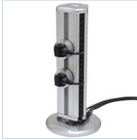
Organised cable management.